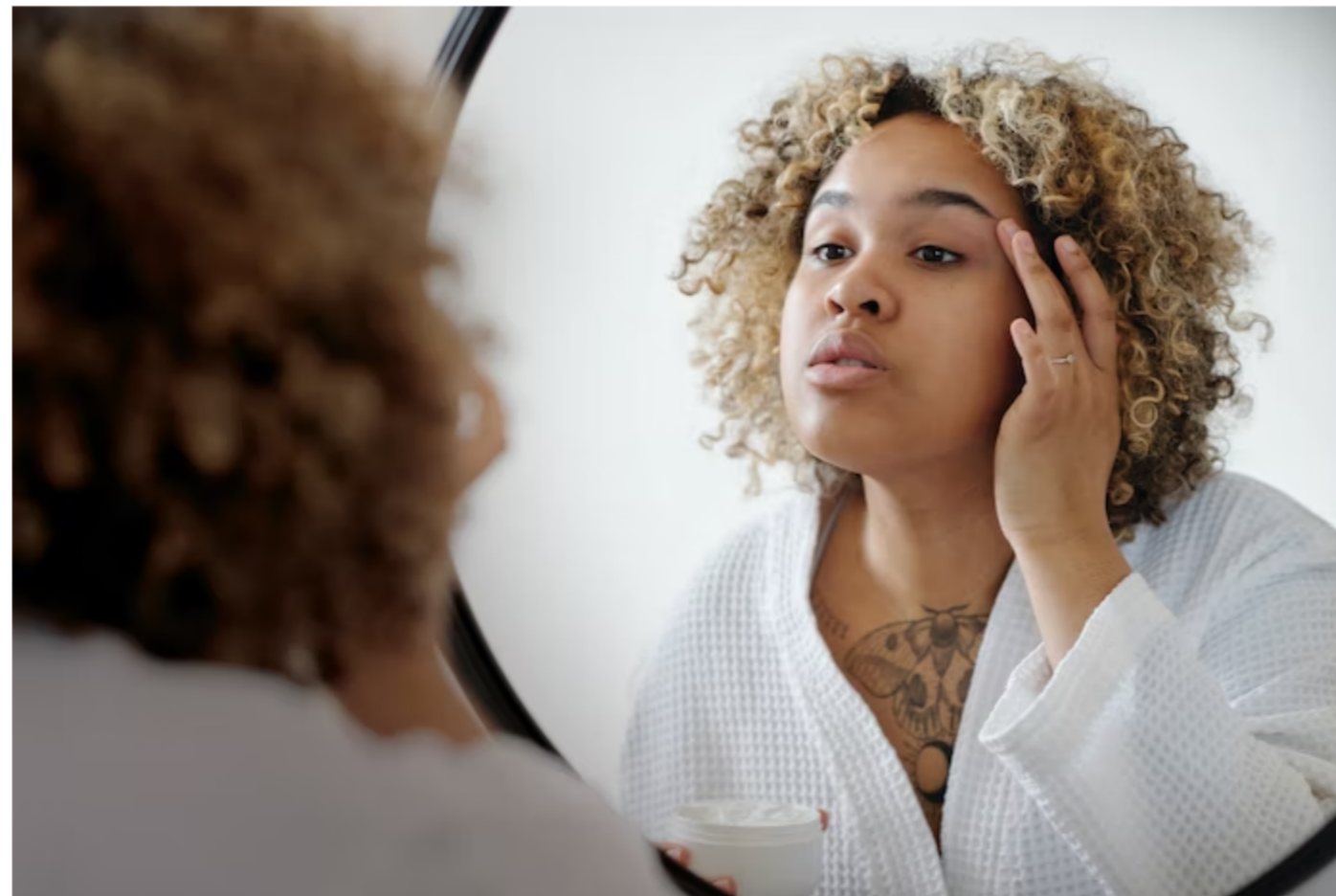
While anti-aging has been studied extensively, the science and ingredient development in the space has rarely centered people of color. New initiatives are correcting that.

In the past, beauty consumers often fell into one of two categories: those who want the most medically backed, science-based personal care, and those who want the most all-natural, organic, responsibly sourced products. Today, both demands can often be served with the same offering.